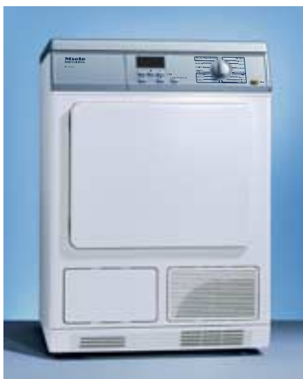
PT 5135 C in white

Miele's compact dryers with honeycomb drum are the perfect combination for the Little Giant washer-extractors.