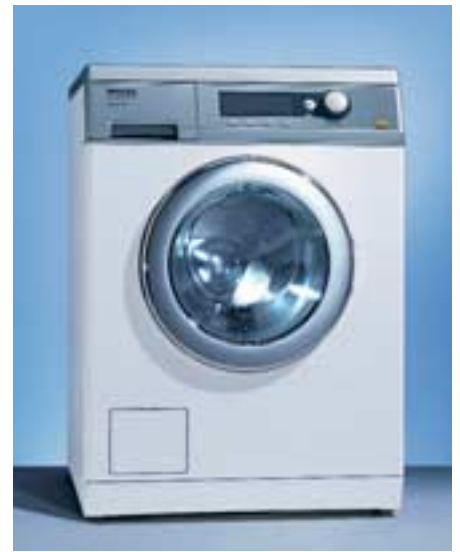
PW 6065 PLUS